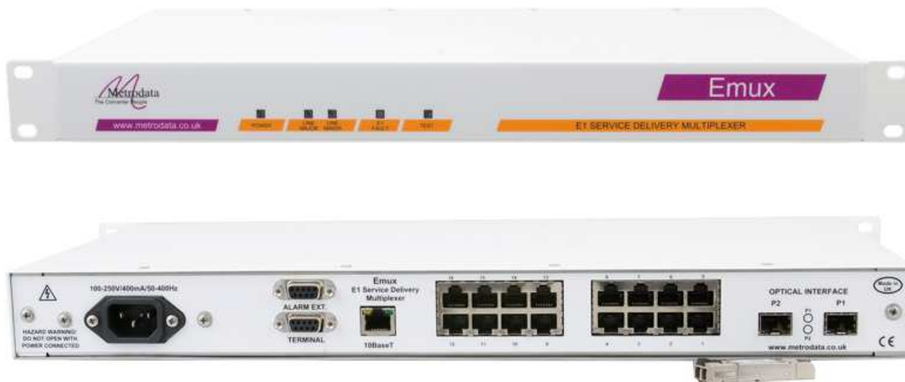
Figure 1: Emux Front and Rear Panels

The Metrodata Emux is a family of products to provide transport of multiple E1 circuits over a dual, resilient fibre interface.